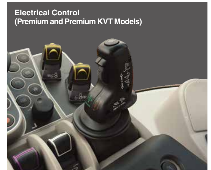
Electrical Control (Premium and Premium KVT Models)