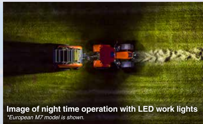
Image of night time operation with LED work lights *European M7 model is shown.

Powerful LED lights ensure excellent visibility when working early in the morning or late at night. (Lighting package will depend on trim level of the tractor)