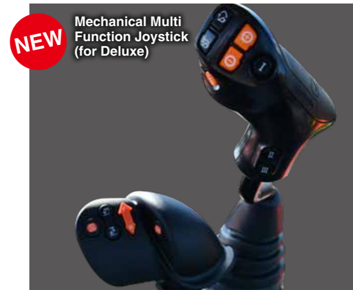
NEW Mechanical Multi Function Joystick (for Deluxe)

New LM2606 joysticks provide maximum productivity for any types of Front loader operations.