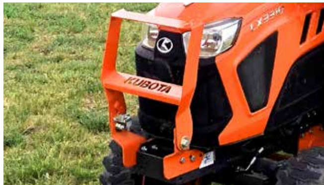
Grill Guard for Non Loader Use