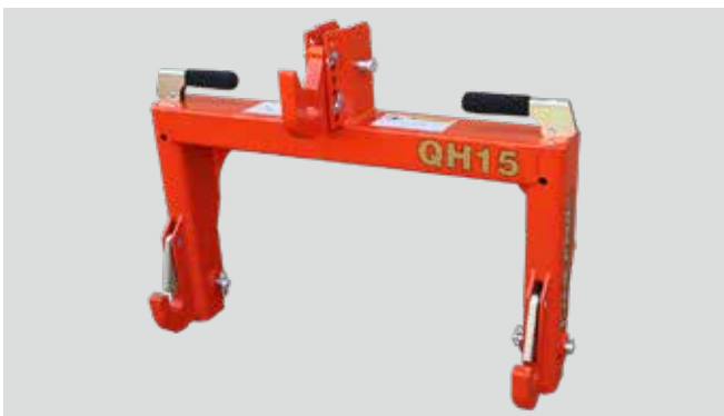
Land Pride Quick Hitch