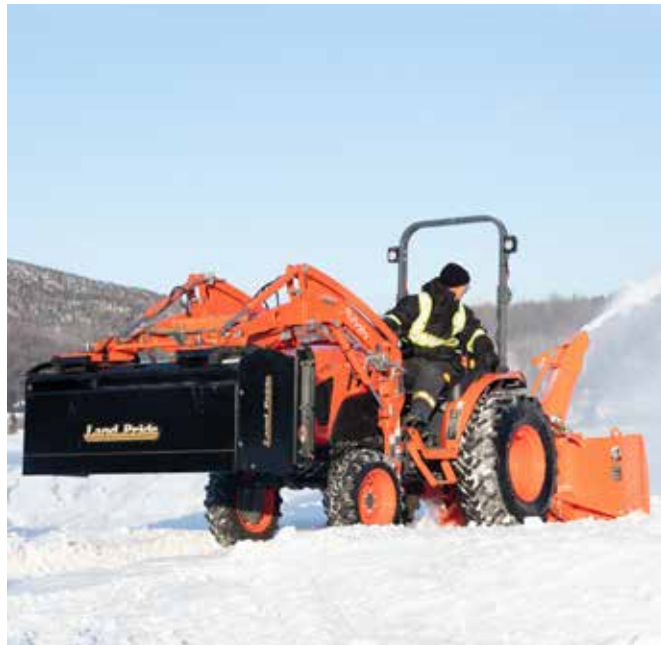
Rear Snow Blower