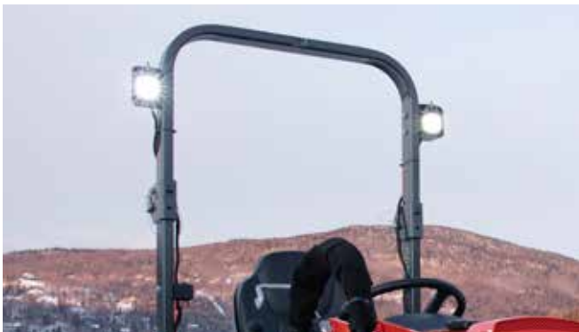
ROPS Universal LED Light Kit