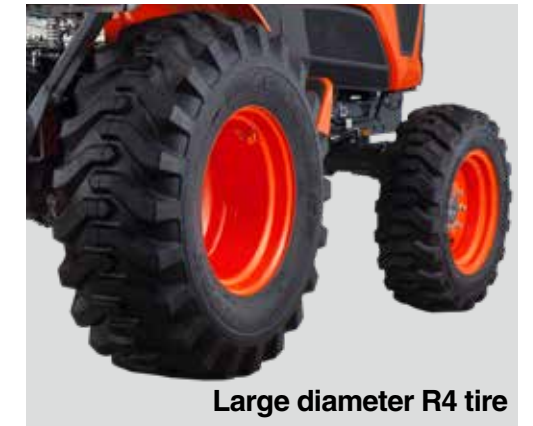
Large diameter R4 tire

The larger diameter in the Industrial and R14T tires offer better performance and stability. (Available in the ROPS models only)