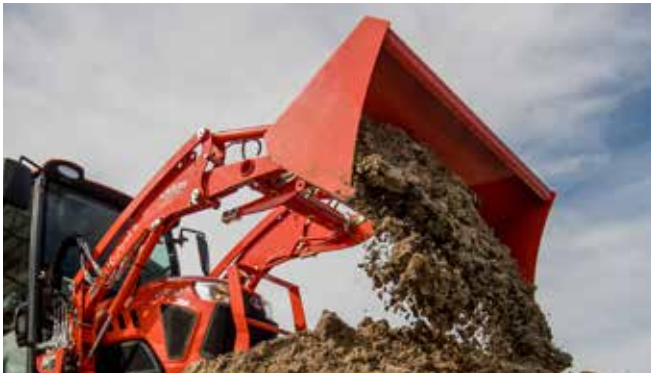
Loader Bucket Options