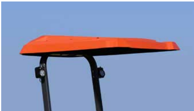
ROPS Quick Attach Canopy