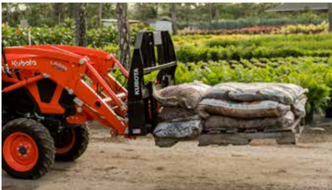
Pallet Fork Options