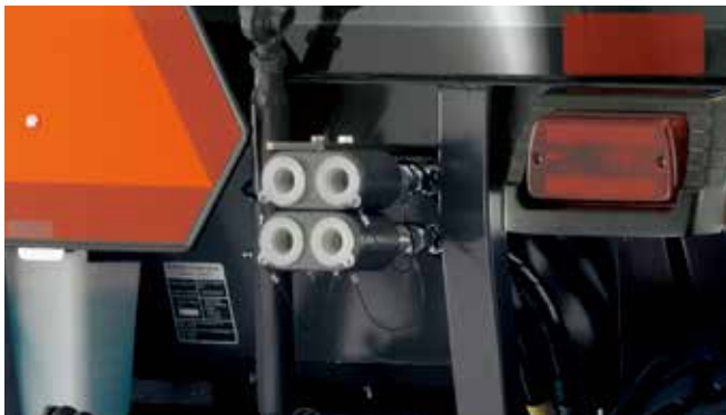
Rear Remote Valves