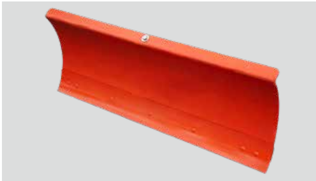
Straight Blade Options