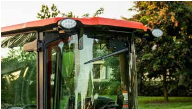
Cab Rear LED Work Lights