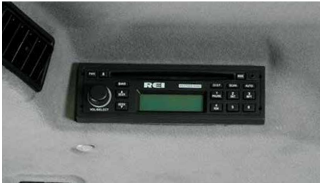
Radio For Cab