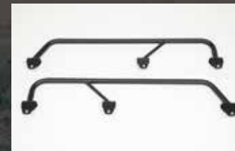
Cargo bed rail