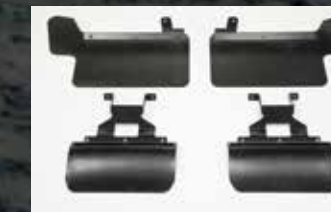
Mud guard (Front / Rear)