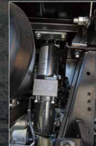
Electric hydraulic bed lift kit (left: dump switch / right: lift cylinder)