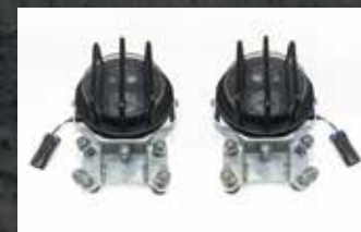
Front work light