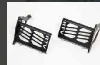
Tail lamp guard