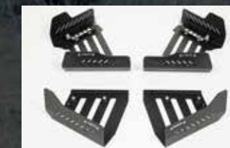
A-arm guard (Front / Rear)