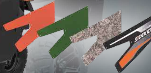
Door insert kits

For More optional cab and variety accessories, please see RTV's accessories and attachment brochure or visit our website,